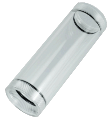
120 mm XL Sight Glass